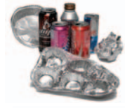
Aluminum Cans and Foil