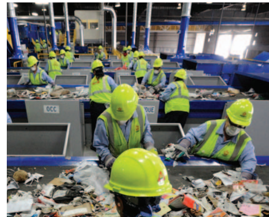
Comingled recyclables from Orange, Los Angeles and San Bernardino Counties are sorted at Republic Services' Recycling Complex located in Anaheim, CA