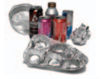
Aluminum Cans and Foil